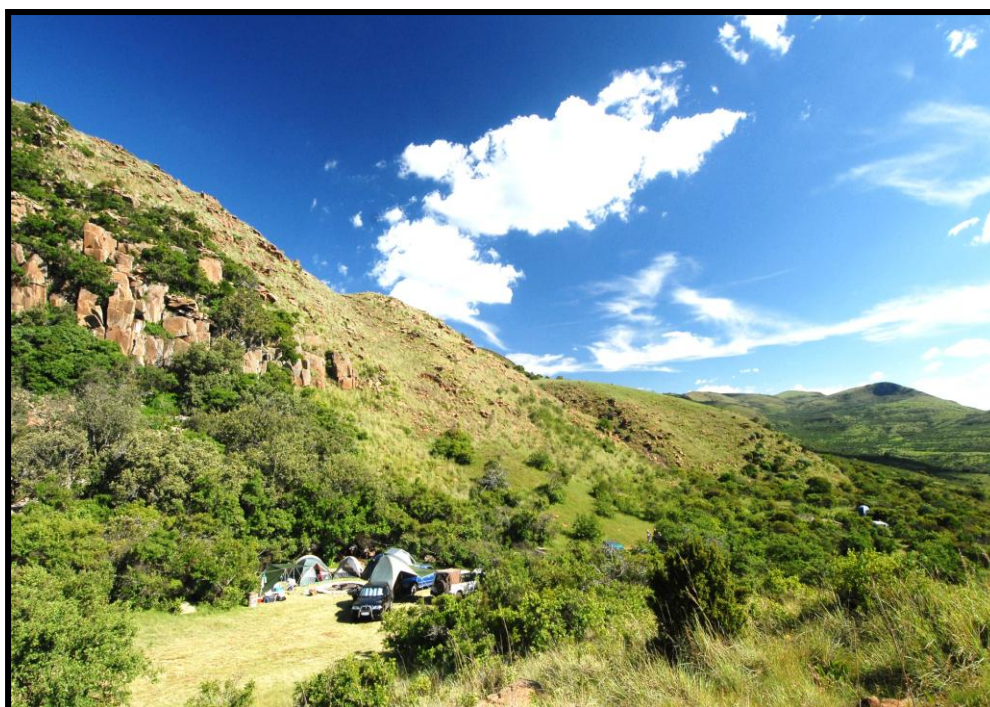
"Rooibektiptol" Camping Grounds

Don't let the family and kiddies miss out on this!